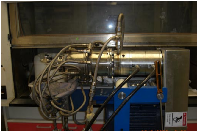
An Innovator ® 200 at the EPA Labs in Cincinnati, Ohio